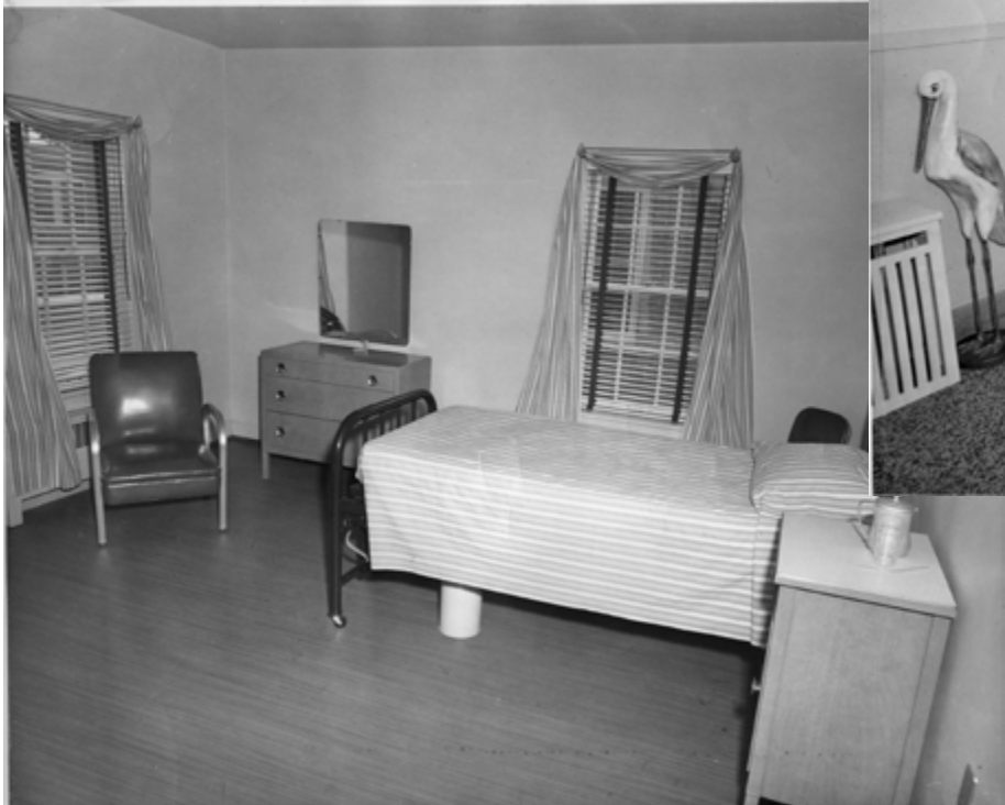
A patient room and the nursery within the original Russell Hospital.