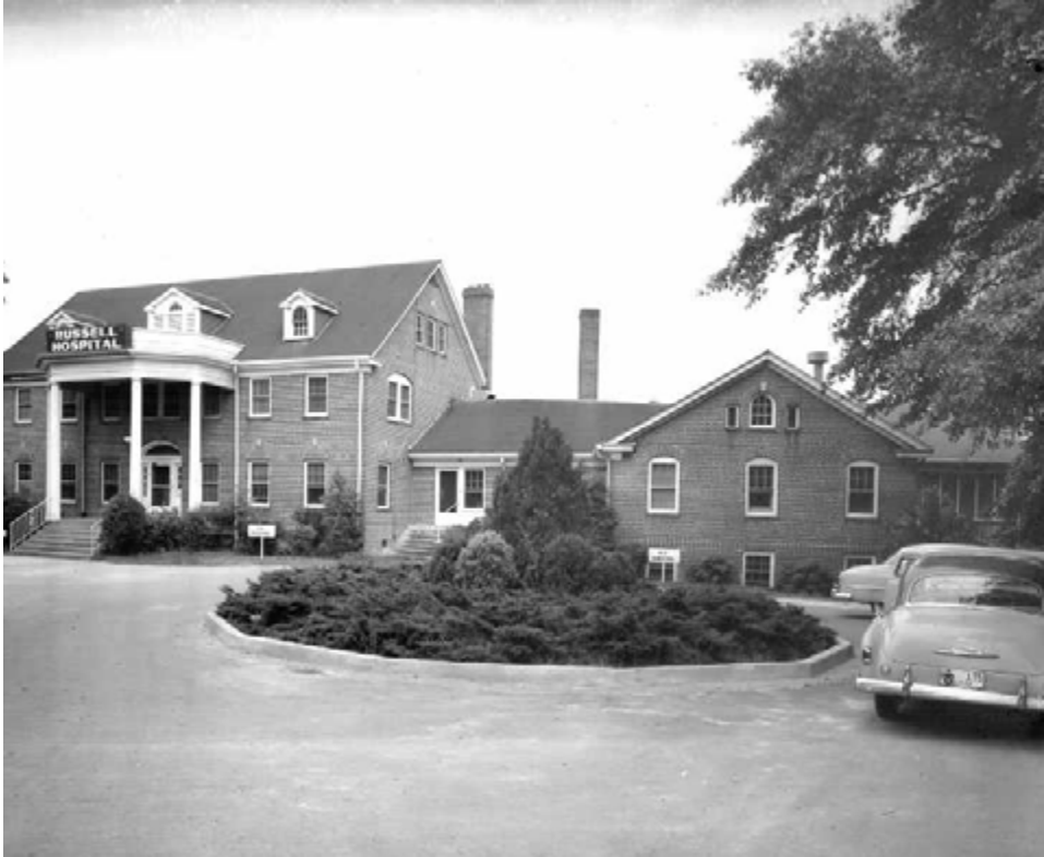
The original Russell Hospital

Stay tuned for Chapter 2 in the next edition of The Centennial!